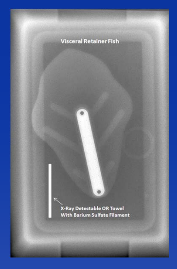
View these pictures at xray.ufl.edu > Patient Care > Practice Guidelines